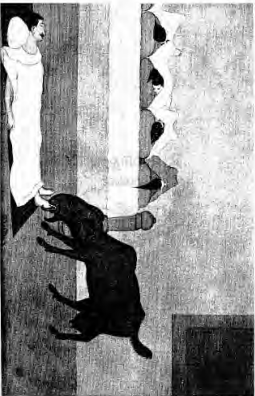
The goat sucking up the life-blood of the artisan.